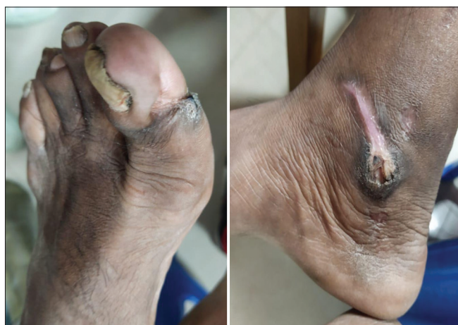
Figure 3: Diabetic foot ulcers after treatment (10 November 2022)

An individualised patient care is the need of the hour in medical science. In Homoeopathy, patients are considered as a whole and the similimum is selected based on the totality of symptoms, which includes the patient's mental, physical and characteristic particular symptoms. The symptoms under totality are repertorised and individualised homoeopathic medicine is selected after consulting Materia Medica literature, on the basis of which the remedy, Lachesis mutus , was differentiated from the other similar high-scoring remedies such as Arsenicum album , Sepia , Dulcamara and Natrum muriaticum obtained from the repertorial analysis. [10] Strong physical generalities, like trembling of the tongue, which catch in between teeth, and pathological symptoms like painless ulcers around the ankles