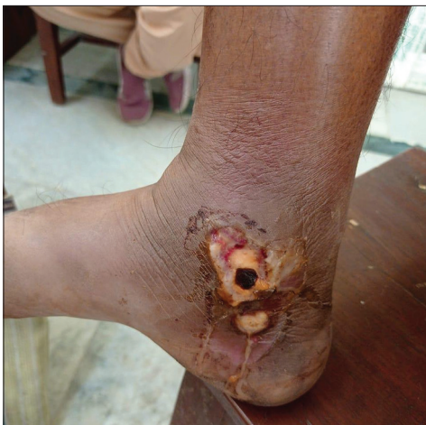
Figure 1: Diabetic foot ulcer before treatment (First visit - 16 August 2022)

Photograph-based evidence of improved ulcer on the left great toe and right middle malleolus is shown in Figure 3.