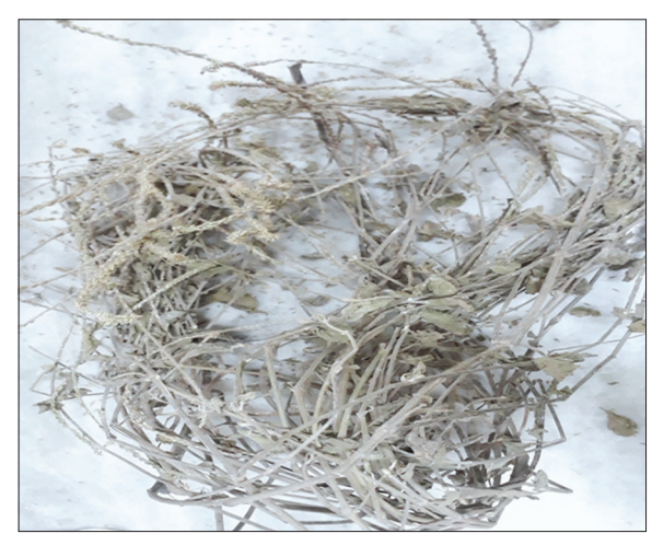
Figure 1: Dried Achyranthes aspera

The percentage yield of water-soluble extract was 20.91%.